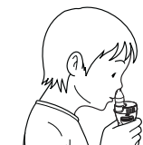
Using the Nosepiece (Option)