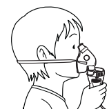
Using the Child Mask