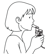
Using the Mouthpiece