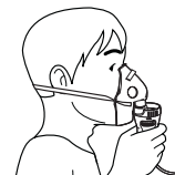
Using the Adult Mask